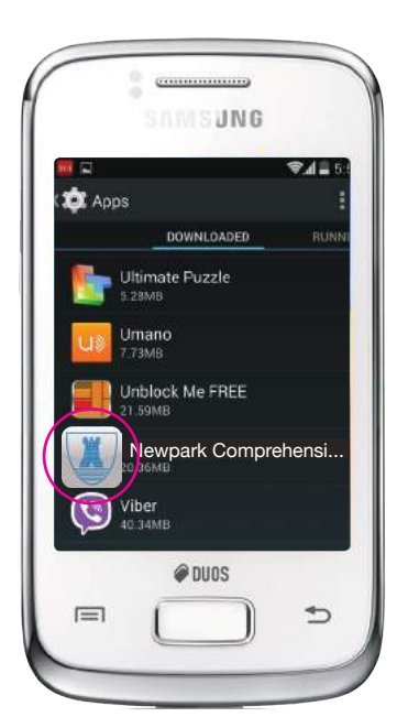
Locate your School App icon.