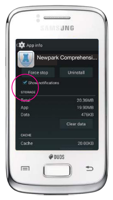
Select 'Show notifications'

Logon to www.newparkschool.ie and you will find the following links: