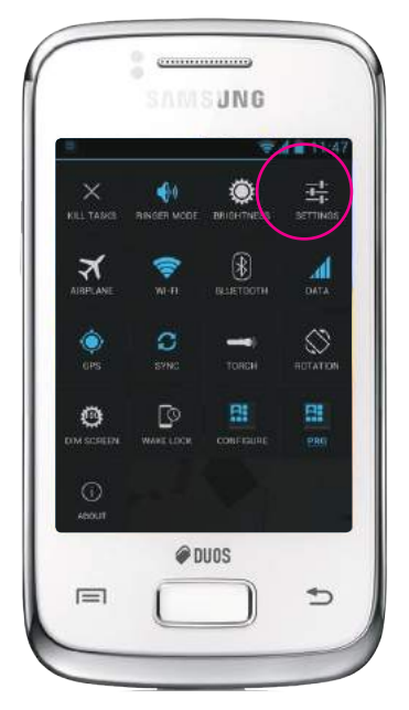
Go to settings